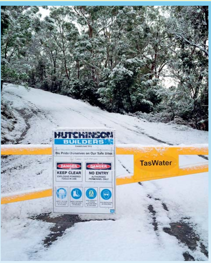
Should that read Tasice?

"The biggest advantage of this type of construction was that we were able to work indoors during Tasmania's wet winter months and we benefitted from better quality control."