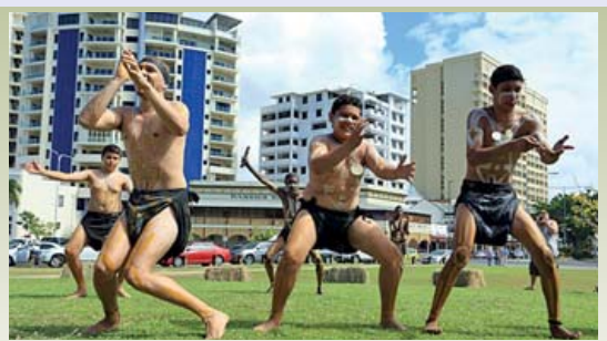
Indiaenous dancers at the festival in Cairns.

"They then walked with us, and continued to quide us on our journey. "Without these amazing men, we could not have done it," he said.