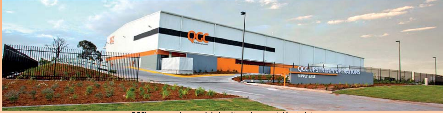
QGC's new warehouse minimises its environmental footprint.

AN $8.5 million new smart warehouse in Chinchilla will act as the distribution centre for all future QGC South East Queensland well engineering operations.