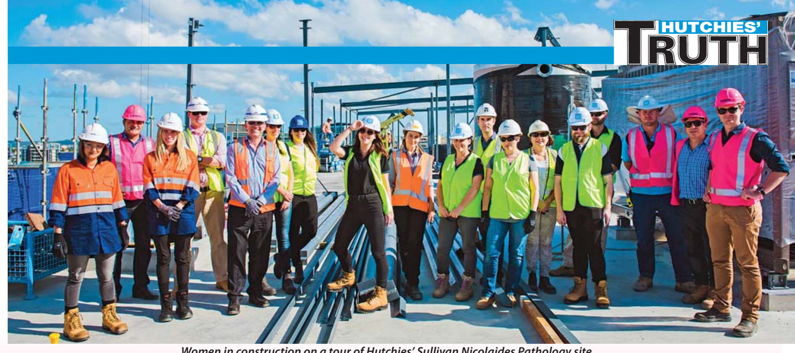
Women in construction on a tour of Hutchies' Sullivan Nicolaides Pathology site.

WOMEN in construction had a unique opportunity to visit a building site when Hutchies opened its Sullivan Nicolaides Pathology headquarters site for inspection.