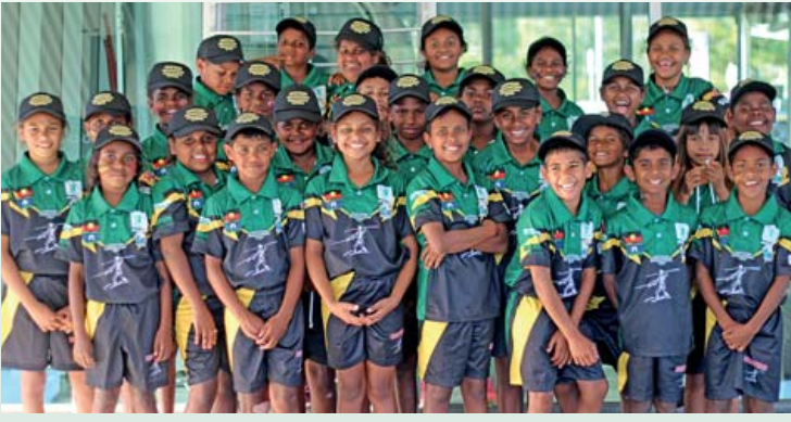
Members of the Palm Island Hunters in their representative uniforms.

Students with an attendance rate of more than 85 per cent and who demonstrated a positive attitude, teamwork, commitment and organisation were selected