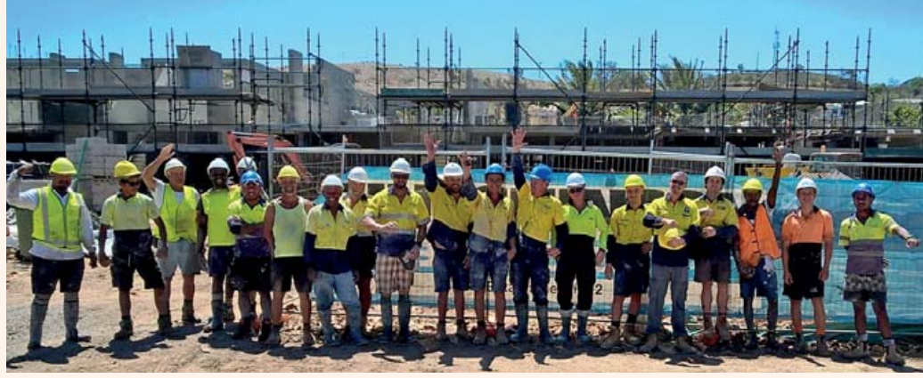
Hutchies' team members on site on Thursday Island.