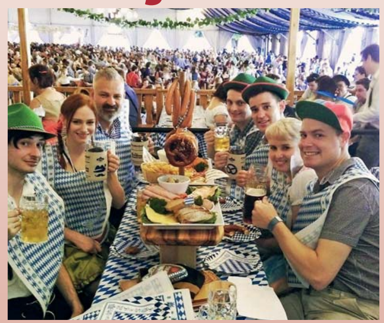
Some of Hutchies' crew getting into the swing of the Brisbane Oktoberfest.

THE Brisbane Oktoberfest is Australia's largest German festival and is ranked ninth best in the world outside Germany.