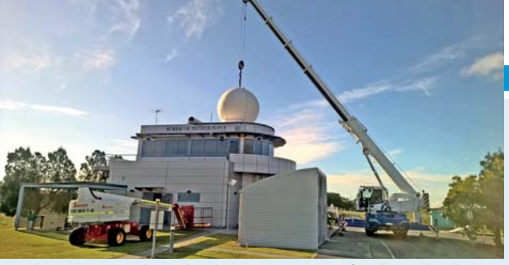
Hutchies is undertaking the decommissioning of radar technology at sites around Australia for the Bureau of Meteorology.

includes the decommissioning and removal of radar technology to BOM airport radar sites around Australia, namely Adelaide, Brisbane, Rockhampton, Townsville and Cairns airport offices.