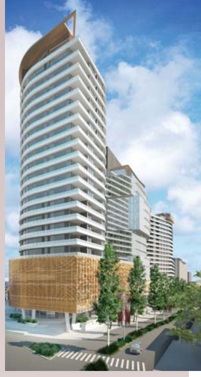
Artist's impression of Southpoint – a mixed-use project being built on the last piece of land to be developed in South Bank.

"Interest in the retail precinct has also been extremely positive