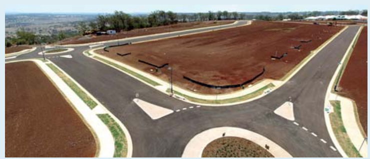
Sanctuary Rise in Wilsonton Heights is a 67-lot subdivision as part of a six-stage development underway by Hutchies.

Job Description: This project involves the construction of a new trade skills training centre at Boonah State High School. The building is comprised of workshop area, food technology kitchen as well as staff and storerooms. Extensive paths and extensions to existing retaining walls are also included.