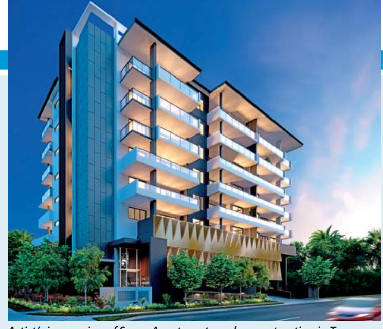
Artist's impression of Sense Apartments under construction in Toowong, Brisbane.

Job Description: The Downlands Year 7 building project involves the demolition and refurbishment of two science labs of the Clark Wing and all teaching spaces of the McKenna Building. Both buildings are within the active campus of the school and involve significant staging and hoarding to maintain safety during school times. The project also involves the demolition of existing courtyards and the creation of a landscaped precinct including lit undercover walkways, ramps and paved external areas, as well as demolition of the Old Cody Building, in preparation for another stage of works to be issued in the new year.