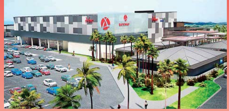
Gateway Shopping Centre in Palmerston, a satellite city of Darwin.

WORK is underway on the $107 million Gateway Shopping Centre in Palmerston, a satellite city of Darwin in the Northern Territory.