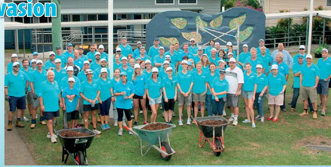
The Aqua Army – as the volunteers are known at Mooloolaba State School.

An extra thanks went to Hutchies for cooking a bacon and egg breakfast for the early morning site preppers and a steak and sausage feast for lunch.