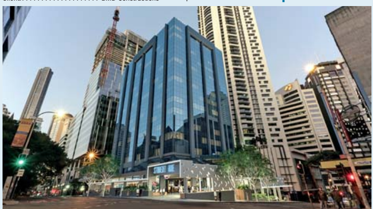
Student One is a refurbishment and conversion of a 14-storey commercial office building into student accommodation.